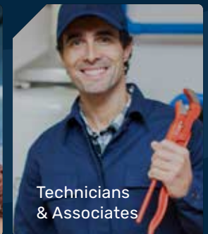
Technicians & Associates