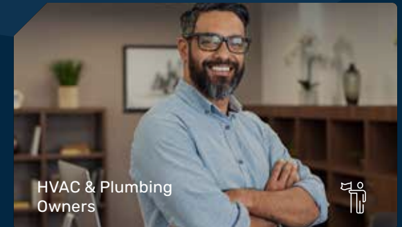
HVAC & Plumbing Owners

Join a family of successful HVAC, plumbing, and home services brands.